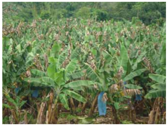
Important leaf spotting caused by Black Leaf Streak Disease on a commercial farm.

Infection results in substantial necroses of the foliage and consequently yield loss, but - most importantly - in immature ripening that renders the fruits unfit for export. Hence, protection of the crop is critically important for the entire industry. In these production environments with conducive tropical humid conditions for Mycosphaerella diseases, the only current practice is chemical control. In addition, to be highly cost effective, the high frequency of sprayings is a constant worry because of the development of fungicide resistance, and also because of the potential effects on both the environmental impasse. Hence, alternatives to chemical control are urgently required to provide sustainable solutions for the management of Mycosphaerella foliar diseases.