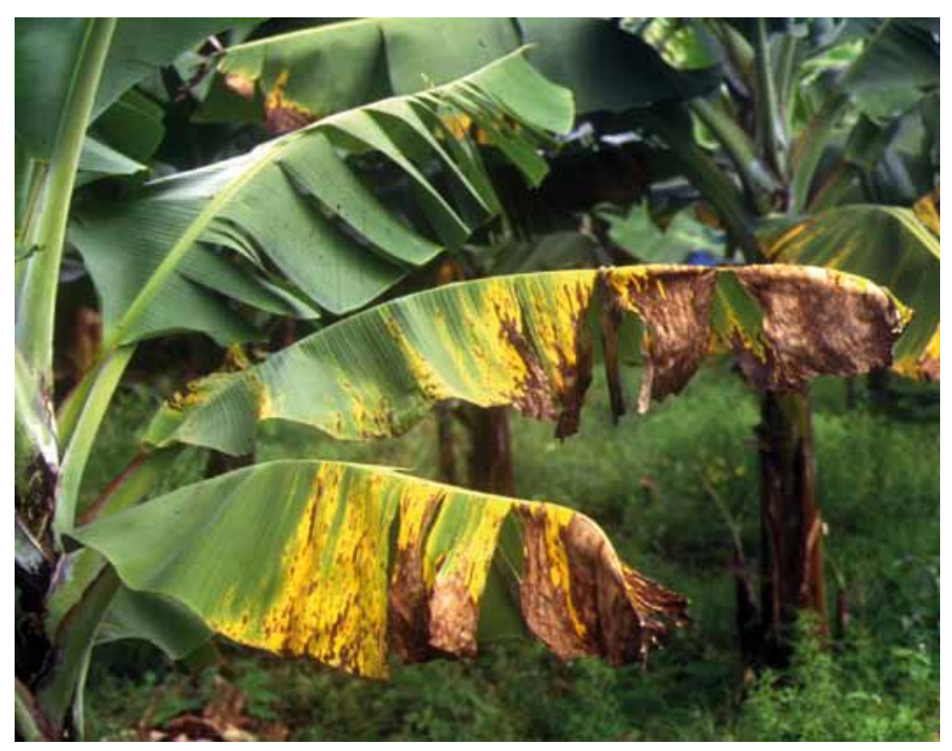
Severe defoliation induced by Sigatoka Disease.

Black Leaf Streak Disease (BLSD, caused by Mycosphaerella fijiensis ) and Sigatoka Disease (SD, caused by Mycosphaerella musicola ) are the main constraints of export dessert banana production. These foliar diseases threaten the major banana-producing countries in the world as all export banana cultivars (Cavendish cultivars) are highly susceptible. Mycosphaerella fijiensis , which is more aggressive than M. musicola , has totally replaced the latter in countries where it has been introduced. Today, virtually all banana- exporting countries suffer from BLSD, with the exception of some islands of the Caribbean (such as Guadeloupe and Martinique) where M. fijiensis